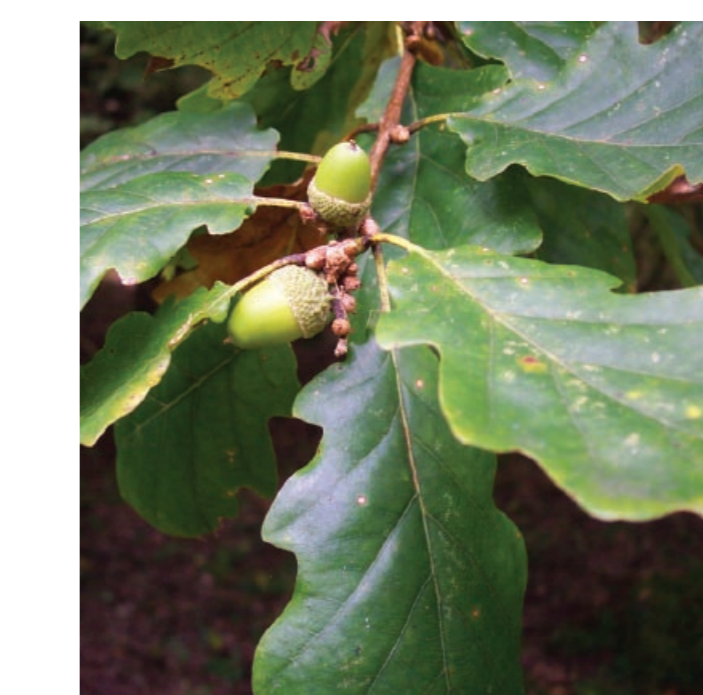
An Dair Nearnghásánach Sessile Oak