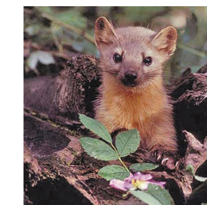
Cat Crainn Pine Marten