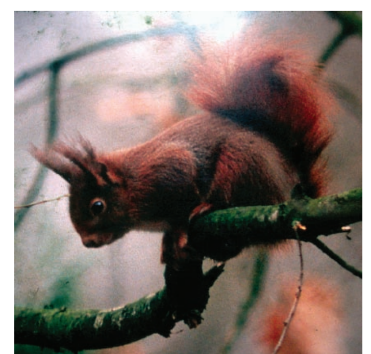
Iora Rua Red Squirrel