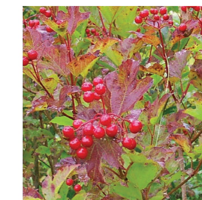
Caor Chon Guelder Rose